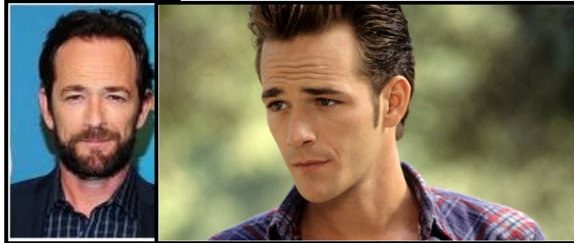
Photo of Luke Perry during go2.0.

Riverdale was in the middle of filming season three when Perry had a stroke. The show has been postponing filming the past few days and they haven’t decided how they are going to continue the show.