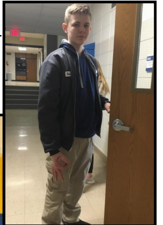
What Is This: Fire Alarm